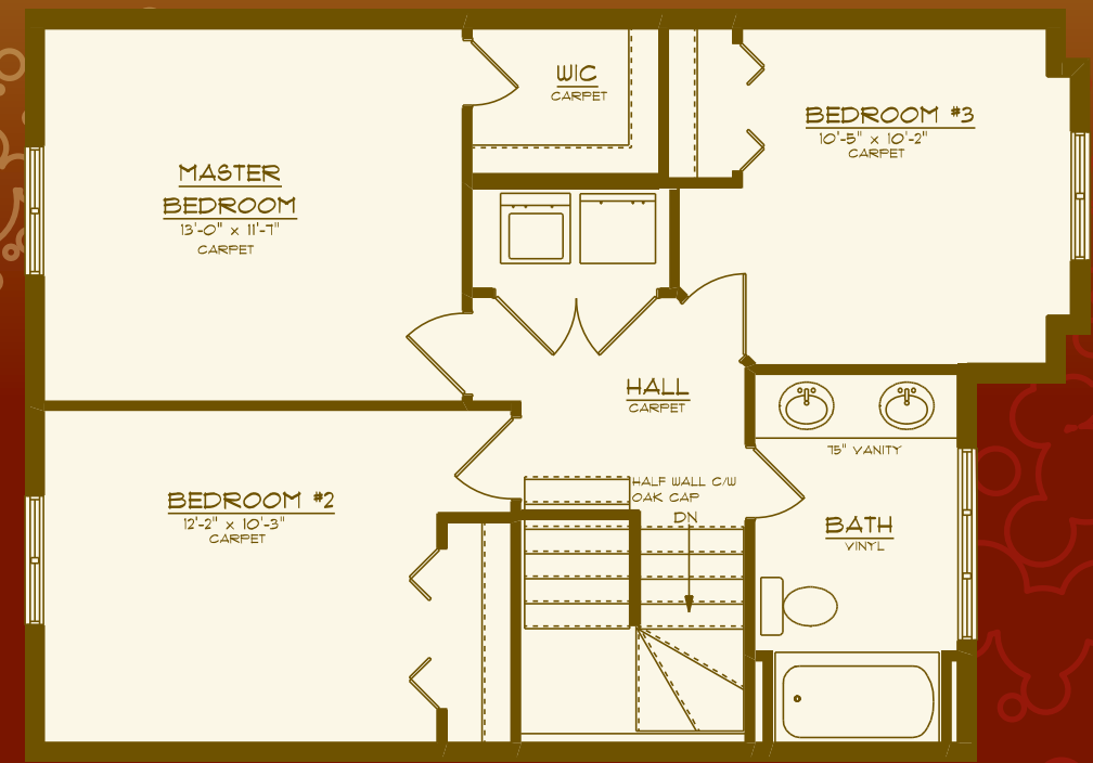
Upper Floor 727 Sq. Ft.

All drawings are artist concepts of the final product and may be revised and/or improved as necessitated by Architectural controls. All floor plans are approximate dimensions. Floor areas shown include "open to below" but do not include garage or basement areas. E. & O. E.