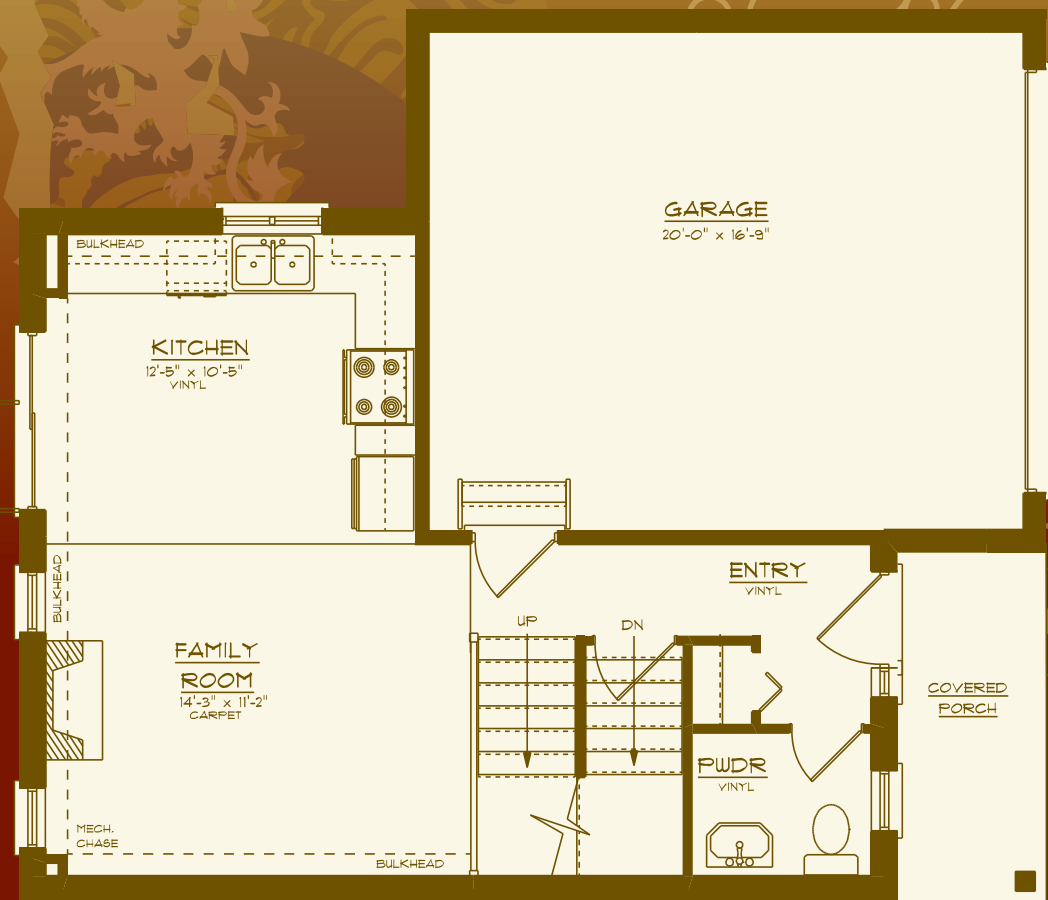
Main Floor 518 Sq. Ft.